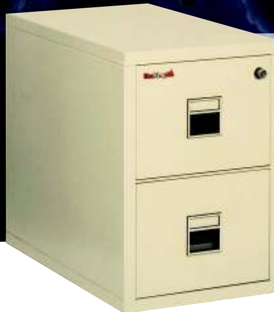
2U2130SCML: Two-Drawer Vertical International

Inside Dimensions: 299 mm H x 387 mm W x 496 mm D 11 25/32" H x 15 1/4" W x 19 7/32" D